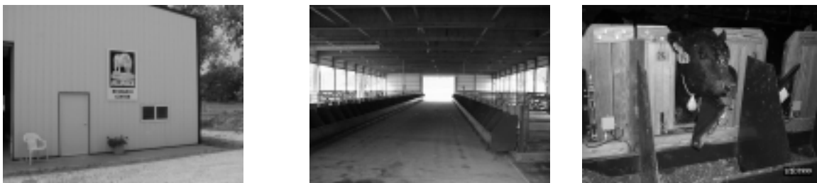
Figure 2. Calan Broadbent Feeding Gates used for measuring intake at Angus Sire Alliance Research Center

Production and Carcass Data: Angus seedstock producers nominate a young sire to be tested in the program by providing semen and the sire for breeding use in Circle A Angus Ranch commercial operations. Sires are bred artificially to commercial Angus females at all three of their commercial cow-calf ranches in Iberia, Huntsville and Stockton, MO. Cows, at random, are also allocated to each sire for natural service use at one of the ranches. Other Angus sires developed from Circle A purebred operations are tested through the program. Traits measured on steer offspring include calving ease, birth weight, weaning weight, backgrounding starting and ending weight, feedyard starting and ending weights, yearling weight, yearling ultrasound %IMF, yearling ultrasound ribeye area, yearling ultrasound fat thickness, carcass weight, carcass marbling score, carcass %KPH, carcass ribeye area and carcass 12-13 th rib fat thickness. Data collected on heifers include calving ease, birth weight, weaning weight and yearling weight. Steer contemporary groups are established at birth and defined by birth pasture. These contemporary groups remain together and are not sorted from that point forward through harvest. At weaning, steers are backgrounded at the ranches for approximately 120 days. They are then shipped to a cooperating feedyard until harvest.